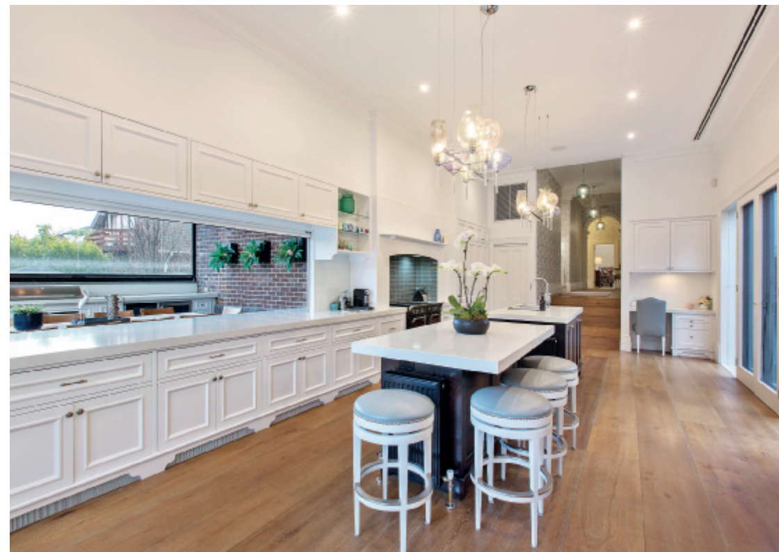
Elegant 5-bedroom Victorian with stylish contemporary interior and wonderful zoned indoor/outdoor living and entertaining spaces.