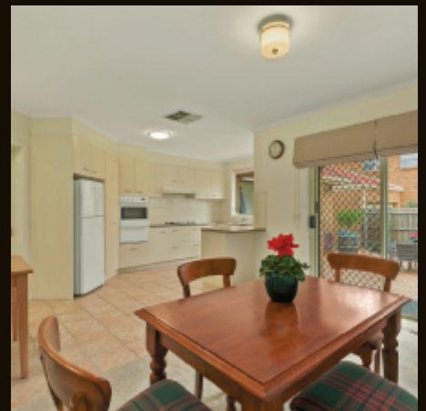
Streetfront, Standalone Style in the Sandbelt