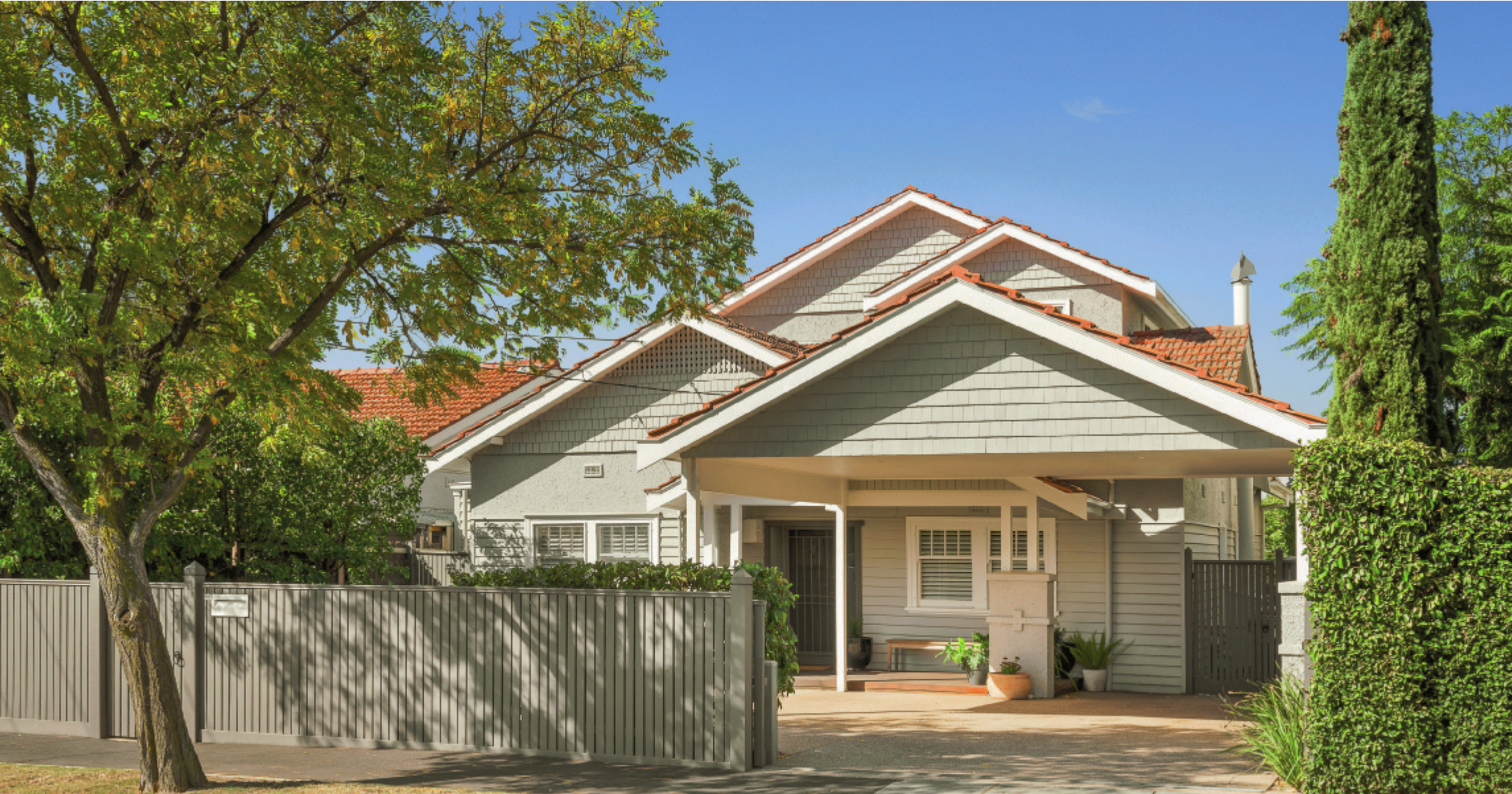
14 Champion Street Brighton Family entertainer in a blue chip locale