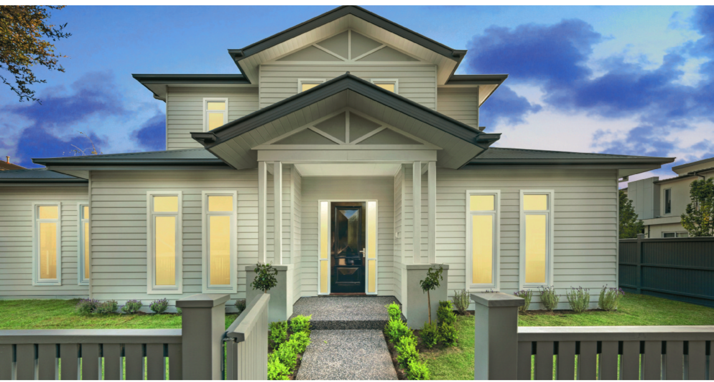
136 Thomas Street Hampton Palatial, Prestige & Poolside Living