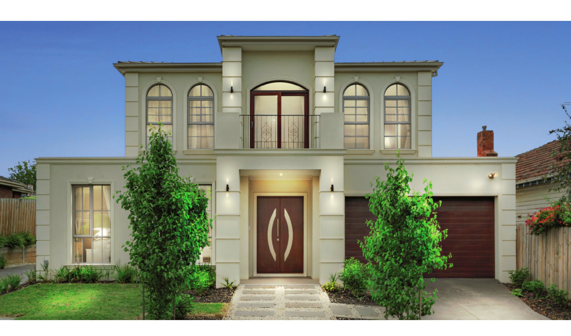
1/3 Meadow Grove Deepdene