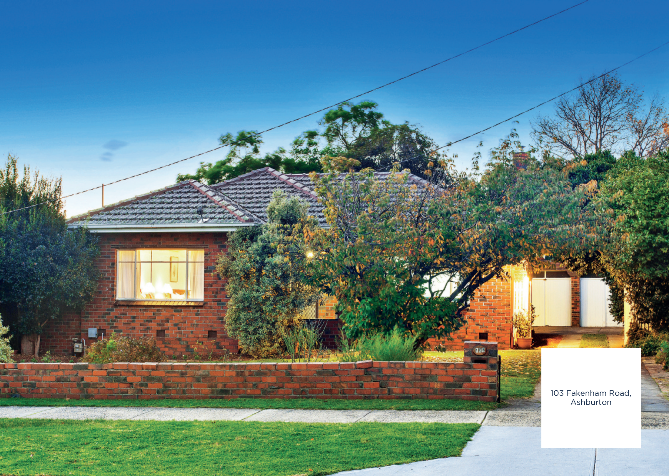
103 Fakenham Road, Ashburton