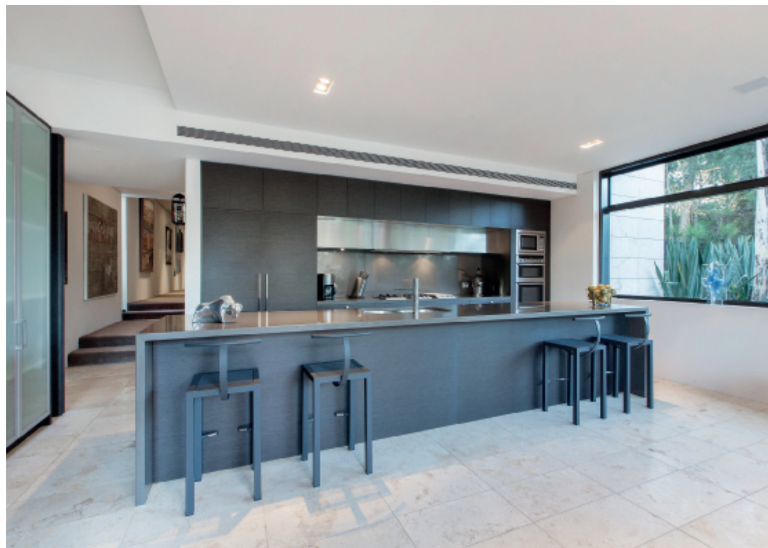
Opening to an expansive terrace overlooking the river, the inviting living/dining area is served by a sublime Gaggenau stone kitchen.